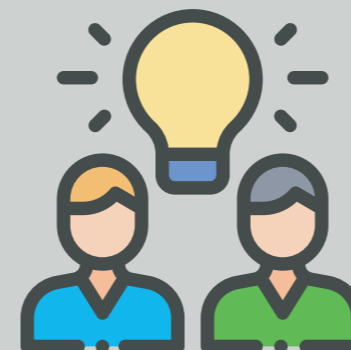
New Ways of Working